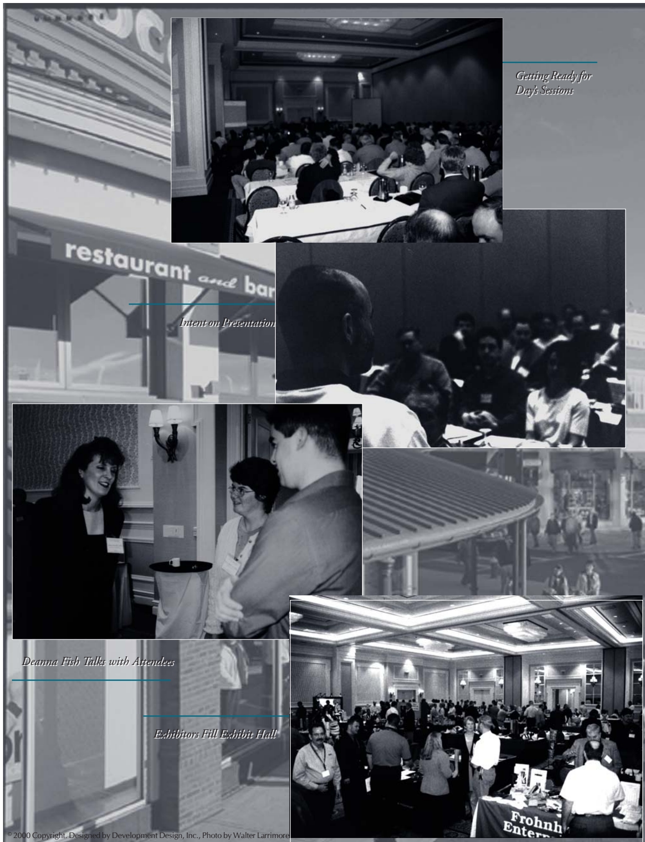
Getting Ready for Day's Sessions